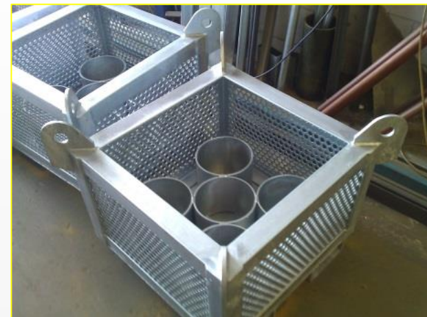
DRILL HEAD BOX