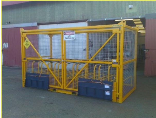
LARGE OXY RACK