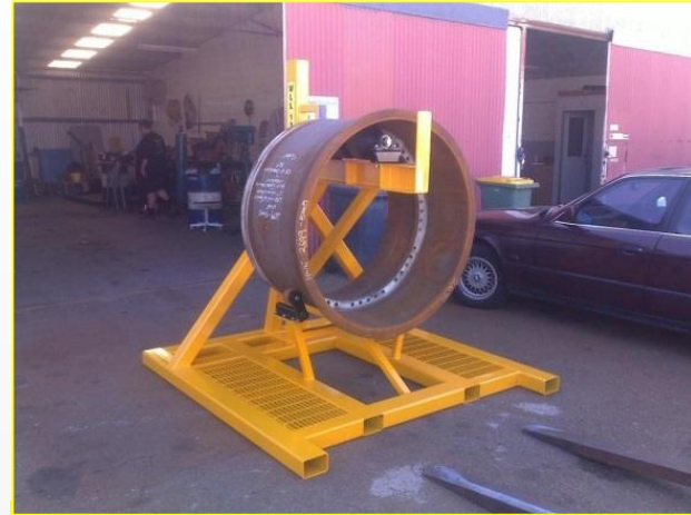
RIM ROTATOR MAINTENANCE STAND

All tyre and rim stands are certified and tested with engineering authorisation