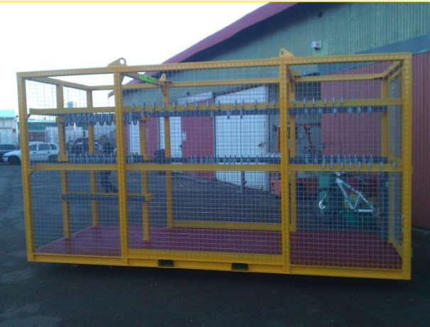
LIFTING EQUIPMENT CAGE