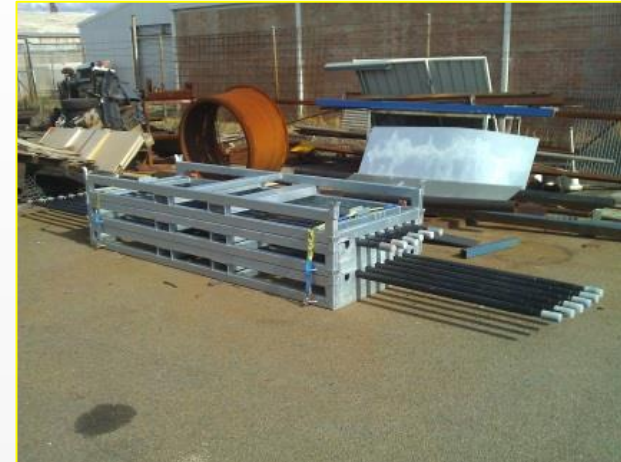
DRILL ROD TRANSPORT FRAME