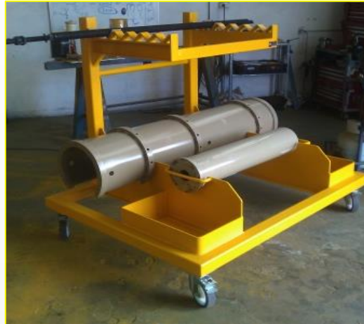
PIN REMOVAL TOOL TROLLEY