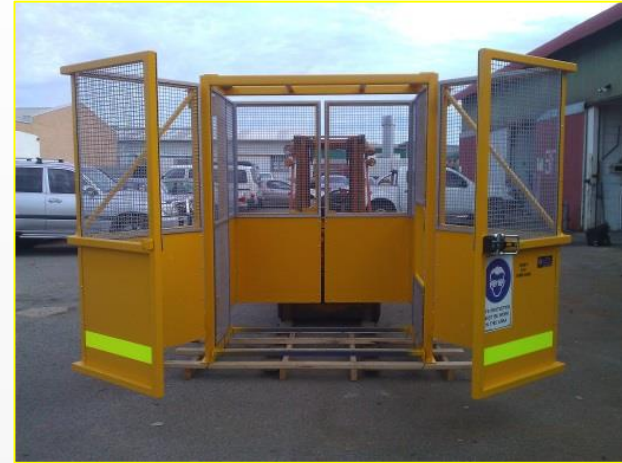
VERTICAL PRESS SAFETY CAGE