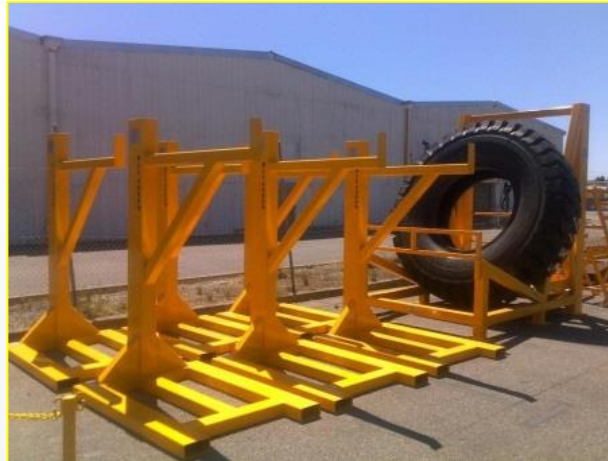
RIM COMPONENT STAND