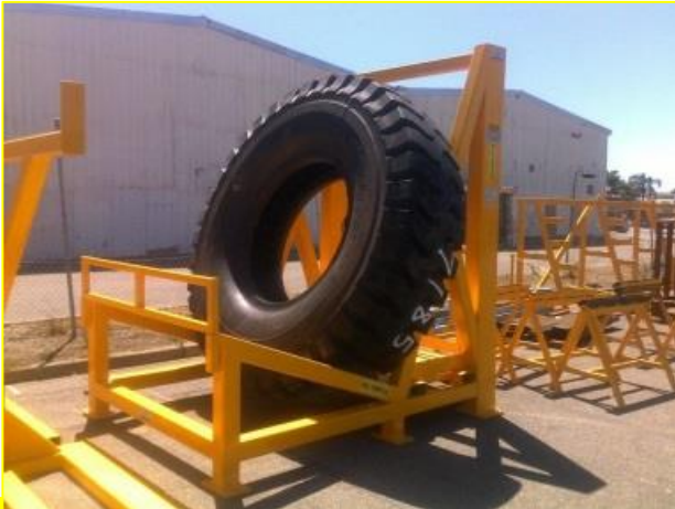
TYRE MAINTENANCE STAND