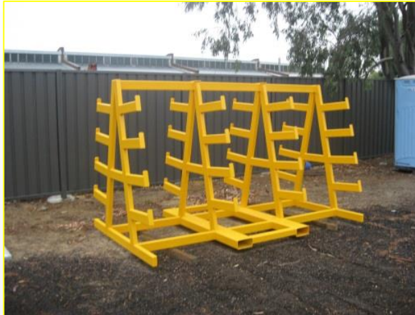
DOUBLE SIDED OFFCUT RACK