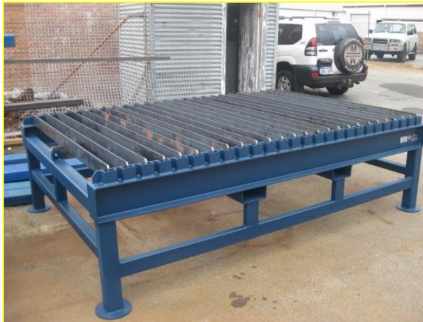
OXY CUTTING TABLE